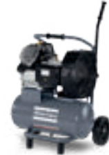
AF 30 E 24