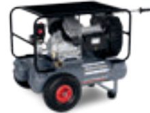
AF 30 E 22