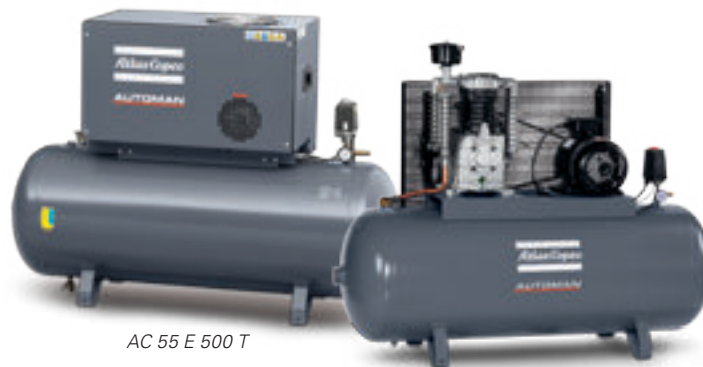
AC 55 E 500 T