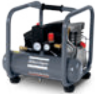
AF 20 E 6