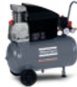
AF 20 E 24