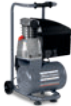
AF 20 E 10